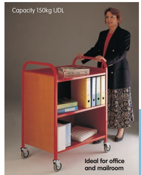
Ideal for office and mailroom

Tubular steel frame with three steel trays. Back and sides infilled with varnished MDF panels. 4 x 100mm swivel castors with grey non- marking tyres and thread guards. Overall L x W x H: 825 x 555 x 1050 mm Shelf L x W: 750 x 500mm Shelf heights: 200; 550; 895mm Total weight: 38kg Red handle Ref: TT20R Green handle Ref: TT20G Yellow handle Ref: TT20Y Blue handle Ref: TT20B